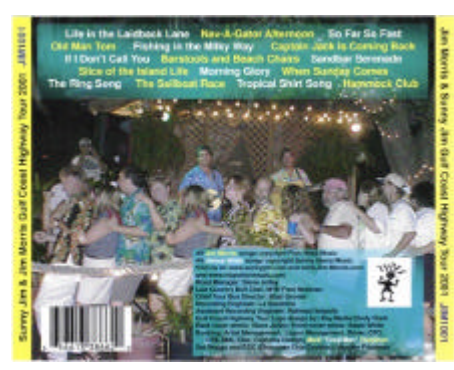
CD back cover featuring the "Biloxi Bobsled"

whole process over to Mobile the next afternoon to do it all again (minus the after-party-party). But we were up to the challenge, and a great time was had by all.