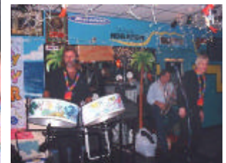
Seeing the old year out and the new one in with great phriends and great music