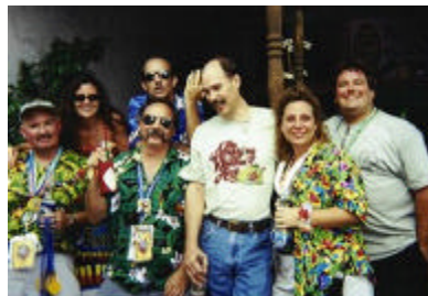
Gathering at the Street Fest