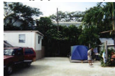
Stubborn campers not giving in yet