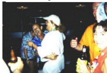
And just who is leading?