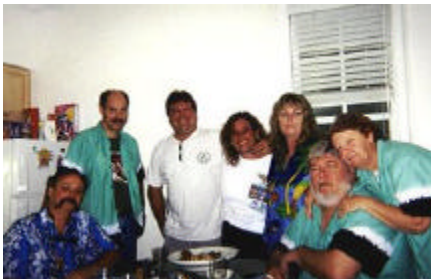
Phriends reunite at Hemi's condo

caught up with us and an evacuation was issued for all visitors on the island. So, the events were forced to come to an early end. Our club members left the island in a number of ways. The Casa Marina arranged for a bus filled with Corona and cheeseburgers to transport parrotheads to the next big city where the party continued. Some caught early planes off the island, and some hopped in their cars and started their drive home early. There were a few who, as stubborn as we were, spent that night on the island in a tent only to be awakened the following morning by very strong winds blowing the tent sideways, and slight flooding on the inside of the tent. But, since most everything was closed down and boarded up, even we decided to leave. No matter how we evacuated the island, we all left with smiles that live on in our hearts. I have a feeling if you ask those who were there, they would tell you that they are already registered for next year.