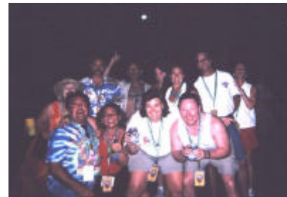
Mugging again at the Beach Party