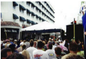
Listening to Mac at the Street Fest